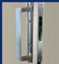
Contemporary satin nickel